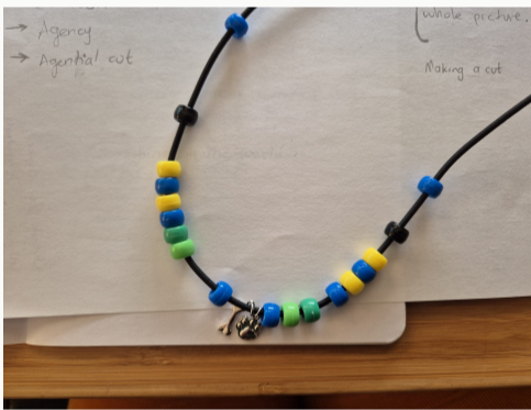
Could it be a cutting together apart? The beads in the necklace are together and apart

A freezing frame as a metaphor of an agential cut, guided by the curiosity of the researcher